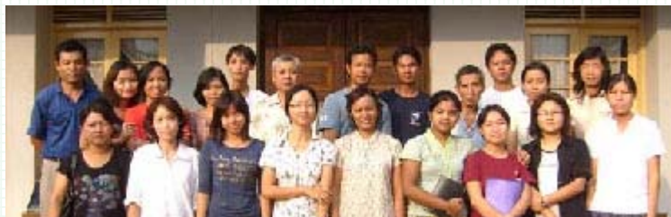
Library internship participants & instructors

To promote library science, MIT conducts library internship every summer. This year 14 persons attended the internship from March 30 to April 30.